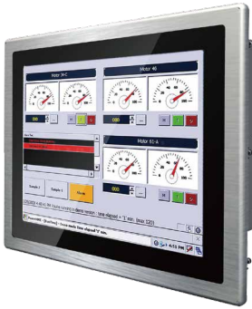
Real Flat Panel Mount (IP65 front side)