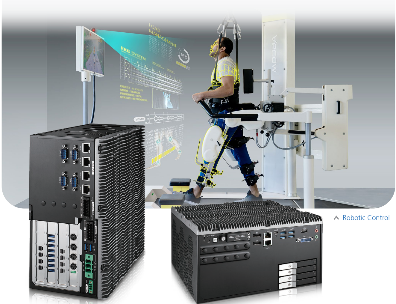
^ Robotic Control

13th/12th Gen Intel® Core™ i9/i7/i5/i3 Processor (Raptor Lake/Alder Lake) Flexible AI Inference Workstation