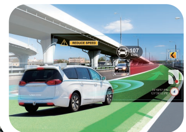
^ In-vehicle Computing