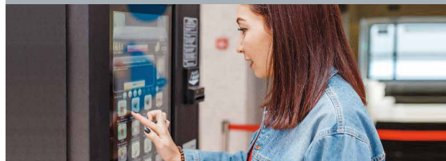
Intelligent Transportation System (ITS)