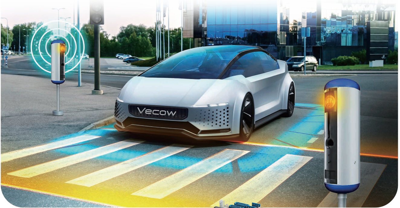
^ Intelligent Transportation

Intel® Core™ 200S Series and 14/13/12th Gen Intel® Core™ Processor 5.25" Embedded Single Board Computer