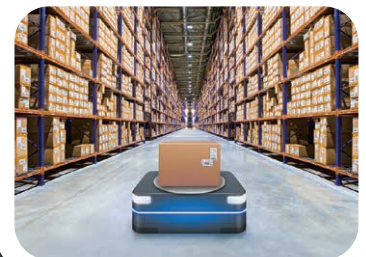
^ Advanced AMR