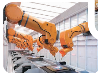
∨ Smart Manufacturing