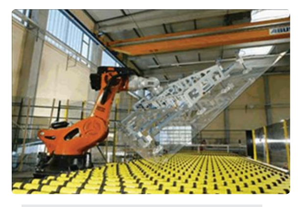
Huge Command Buffer and Real Time Coordinate Transformation Suitable for Robotic Control