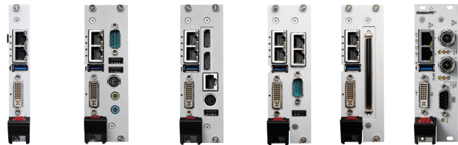
cPCI-3510(BL) cPCI-3510(BL)D cPCI-3510(BL)G cPCI-3510L cPCI-3510M cPCI-3510T